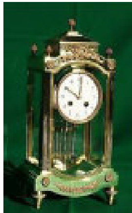
A Gold Plated Clock using Plug N' Plate®

I am a watchmaker in Scottsdale, Arizona and I specialize in restorations of fine antique watches and clocks. I was recently commissioned to restore a one-of-a-kind French clock, circa 1860 which was ornamented with hand-made, gilded accents. The original gold was long gone due to improper handling. Because the clock is irreplaceable as are the hand-made accent pieces, I did not feel comfortable in sending them to another state for plating because of the possibility of loss or damage. I bought one of your Plug N' Plate® kits to see if I could achieve a good finish at my own bench. Your product totally exceeded my expectations! It is easy to use, put down a uniform layer of beautiful 24k gold (after proper cleaning of the pieces of course) and the clock is simply stunning. Your products have opened-up the door to yet another service I can offer my clients. Thank you very much for making such a fine, fun and easy to use product, which yields excellent results!