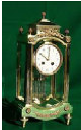
A Gold Plated Clock using Plug N' Plate®

I am a watchmaker in Scottsdale, Arizona and I specialize in restorations of fine antique watches and clocks. I was recently commissioned to restore a one-of-a-kind French clock, circa. 1860 which was ornamented with hand-made, gilded accents. The original gold was long gone due to improper handling. Because the clock is irreplaceable as are the hand-made accent pieces, I did not feel comfortable in sending them to another state for plating because of the possibility of loss or damage. I bought one of your Plug N' Plate® kits to see if I could achieve a good finish at my own bench. Your product totally exceeded my expectations! It is easy to use, put down a uniform layer of beautiful 24k gold (after proper cleaning of the pieces of course) and the clock is simply stunning. Your products have opened-up the door to yet another service I can offer my clients. Thank you very much for making such a fine, fun and easy to use product, which yields excellent results!